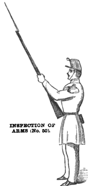
INSPECTION OF ARMS (No. 50).

230. When the instructor shall have passed him, each soldier will