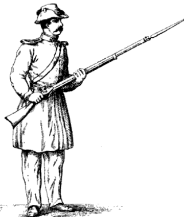
Charge bayonet. N° 195.