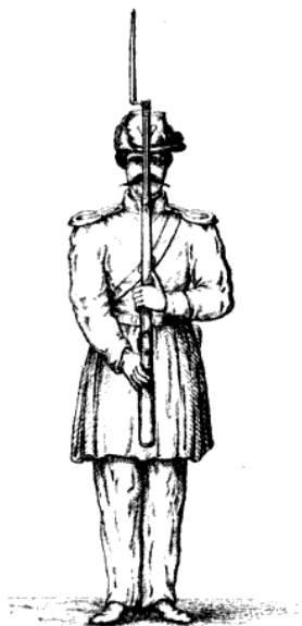
Present arms. N° 142.

the man next on the right, the S plate to the rear. The stack thus formed, the rear-rank man of every odd file will pass his piece into his left hand, the barrel turned to the front and sloping the bayonet forward, rest it on the stack.