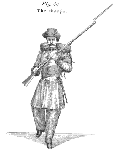
Fig. 40. The charge.

holding the handle at the height of the hips, the left hand in front and at the height of the left breast. At the second command the squad (or company) will move off at the " double quick ," carrying the piece as described.